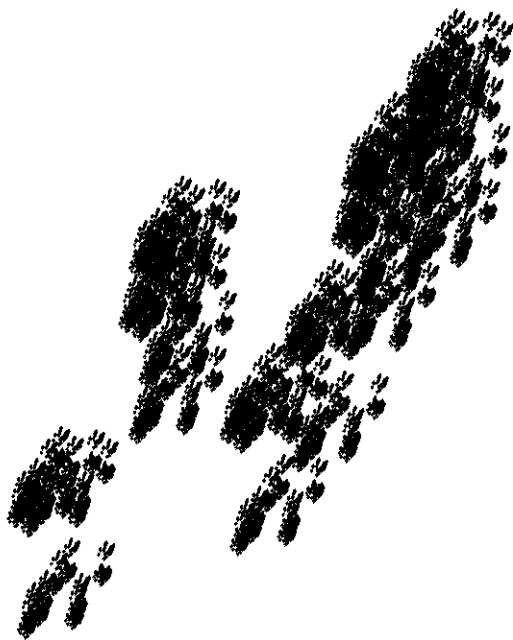
FIGURE 1. Lattice-tile for A = \begin{pmatrix} 0 & 1 \\ -3 & 2 \end{pmatrix} and \mathcal{D} = \{(0, 0), (1, 0), (-1, 5)\} .

The following simple example illustrates several features of the general case: if n = 1 , A = 3 and \mathcal{D} = \{0, 4, 11\} , then I = \{0, 4, 11, 12, 16, \dots\} and \mathbb{R} is tiled by the translates of Q by \mathbb{Z} (see the end of Section 1).