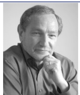
George Friedman Author Archive