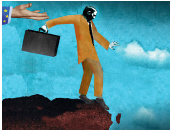
Illustration by M. Morgenstern

IN THE weeks following the collapse of Lehman Brothers last September the number of euro banknotes in circulation suddenly increased. Fears about the rickety state of banks had made many people mistrustful of keeping money on deposit. Far safer to keep cash stuffed under a mattress. The more discriminating hoarders, it was said, were careful to squirrel away banknotes with serial numbers prefixed by the letter "X", indicating currency issued in Germany. Notes with "U" (French) or "P" (Dutch) prefix were also fine, but those with a "Y" or an "S", issued by Greece and Italy, were shunned.