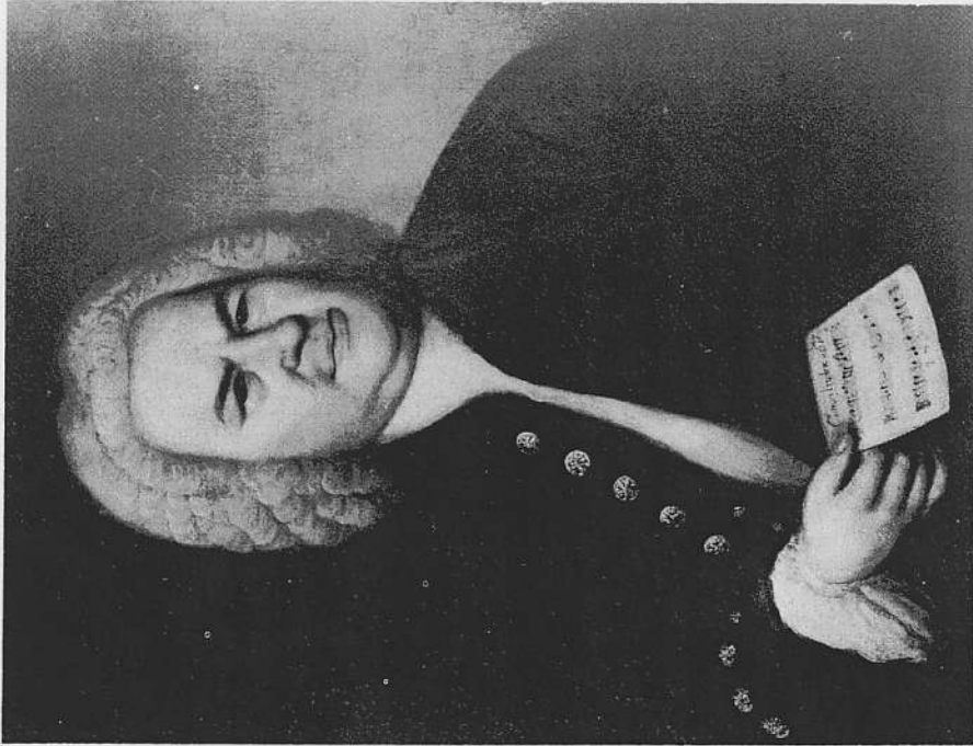
Portrait of Johann Sebastian Bach (1746). Painting by E. G. Hausmann.

MULTNOMAH COUNTY LIBRARY (Library Association of Portland, Ore.)