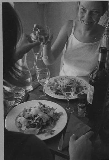
So farewell then, plat du jour

Now, the downturn has produced another reason: price. The upmarket