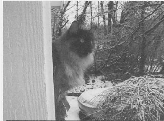
!! Heir ist meine Katze. Sie heiBt "Shadow" und sie ist 4 jahre alt. Es schneit und war sehr kalt, also sie war nicht glücklich. Sie möchte summer und sonnig wetter.