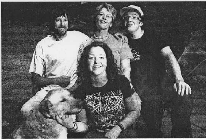
Genießen ein feuer mit meine Vater, Mutter, Schwester, mich und meine Hund "Lucky".