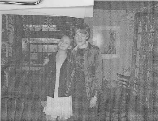
Das ist meine Schwester und ich vor mein Klavier Konzert. Das Klavier Konzert war in Rimsky. Das ist eine Kaffeehaus.

yes! - e Ask me about German SF - or look at my website: "projects + publications"