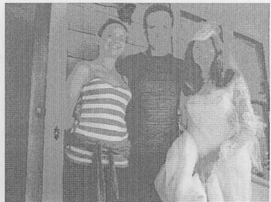
Das ist meine Schwester, mein Vater, und meine Mutter. Es ist Mutter und Vaters Hochzeitstag. Sie sind nach Hause.