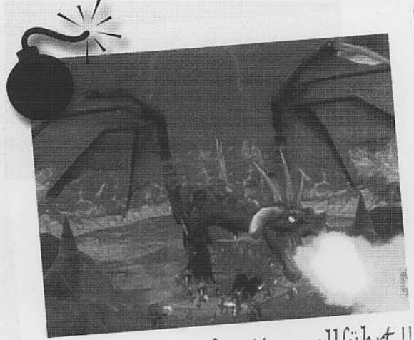
Onxyia ihren tiefen Atem vollführt!!!

Wir spielen World of Warcraft! Donnerstag und Sonntag ist World of Warcraft Schlachtgruppen Nächte von 19.00 uhr bis 21.00 uhr. Wir schlachtgruppen für 2 stunden. Wir haben einen neuen Computer für Sie. Möchten Sie