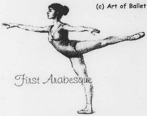
Primera Arabesque: Levantar la pierna