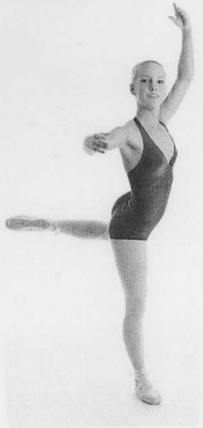
Doblar la pierna