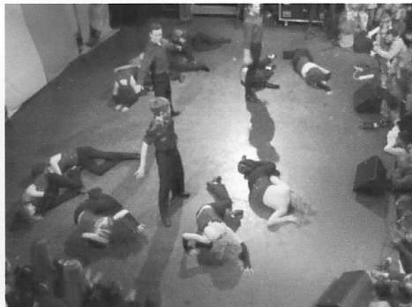
Rince Tr Na ng perform "Snake Dance" St. Patrick's Day - Munich March 2004