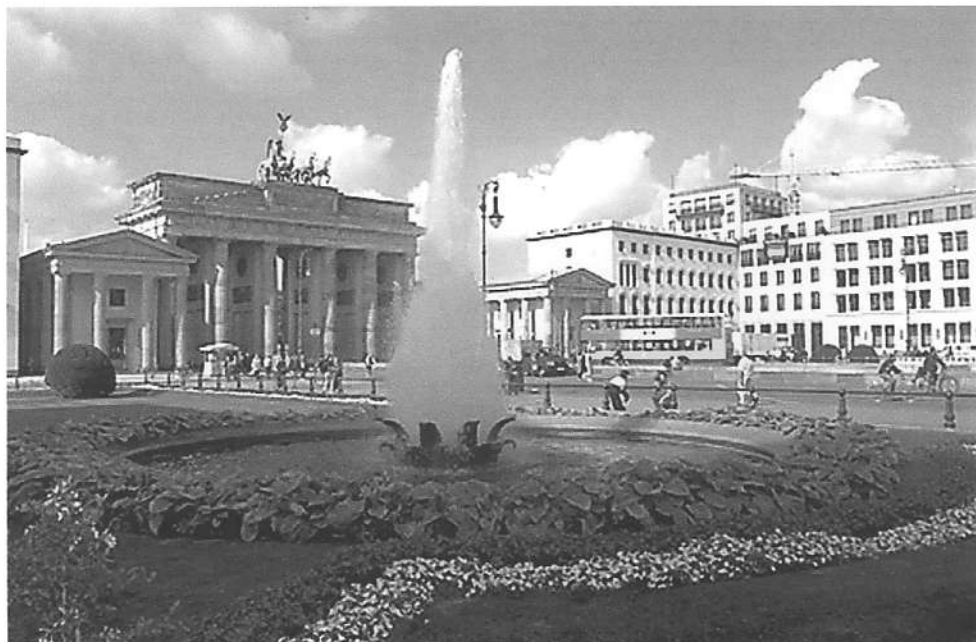
Pariser Platz, Berlin

Collection of ca. 30 pp. of internet pages: scenes, sightseeing, airport maps, transit system, B+B site, currency, museums, Theaters