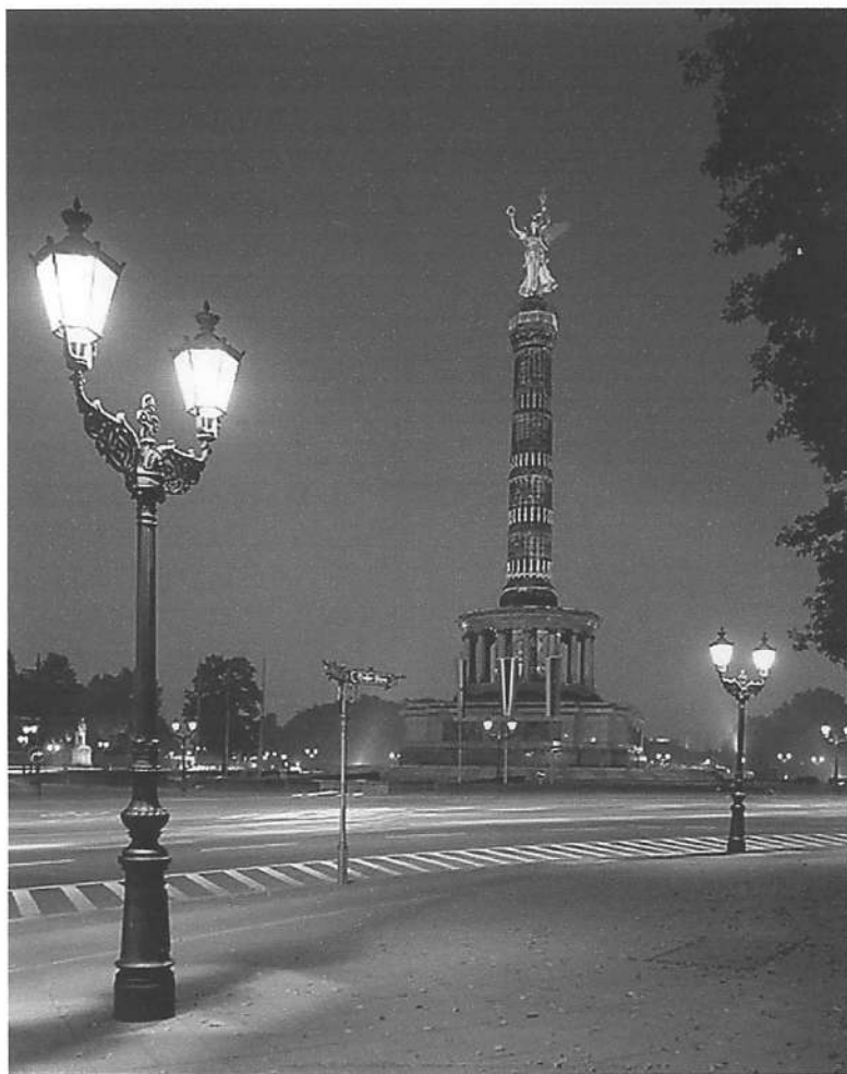
Siegesäule (Victory column), Berlin

Bremen: general tourism, "Schnoor", Shakespeare Company