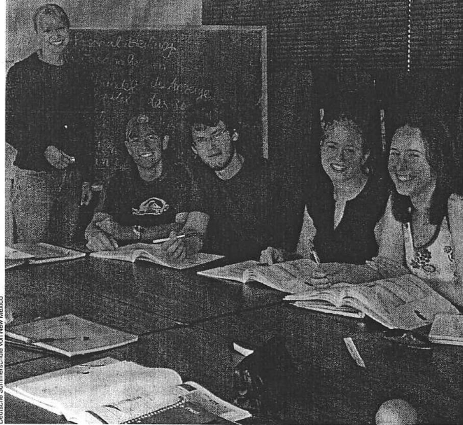
Deutsche Sommerschule von New Mexico

LEFT: Small class size and native speaking instruction provide an excellent learning opportunity at the Deutsche Sommerschule von New Mexico.