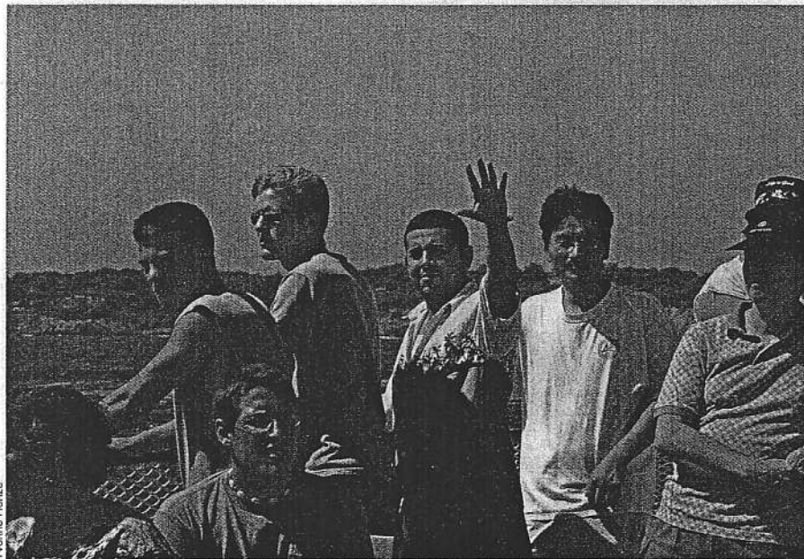
DSSA students enjoy a summer cruise on the historic Newport Harbor.

ty among participants – they welcome traditional college students, business professionals, high school seniors, graduate students from various disciplines, and, of course, life-long learners who simply have a passion for German language and culture.