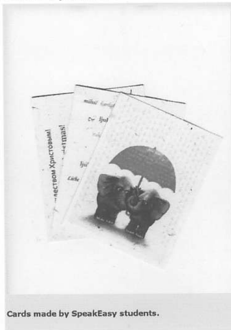
Cards made by SpeakEasy students.