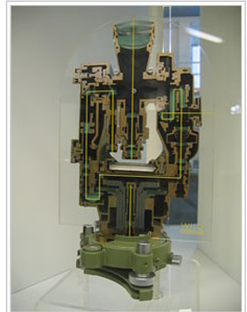
Sectioned theodolite showing the complexity of the optical paths

The first occurrence of the word "theodolite" is found in the surveying textbook A geometric practice named Pantometria (1571) by Leonard Digges, which was published posthumously by his son, Thomas Digges. [2] The etymology of the word is unknown. [5] The first part of the New Latin theo-delitus might stem from the Greek θεᾶσθαι , "to behold or look attentively upon" [6] or θεῖν "to run", [7] but the second part is more puzzling and is often attributed to an unscholarly variation of one of the following Greek words: δῆλος , meaning "evident" or "clear", [8][9] or δολιχός "long", or δοῦλος "slave", or an unattested Neolatin compound combining ὁδός "way" and λίπος "plain". [7] It has been also suggested that -delitus is a variation of the Latin