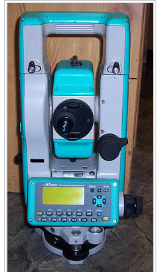
Modern theodolite Nikon DTM-520

Also, many modern theodolites, costing up to $10,000 apiece, are equipped with integrated electro-optical distance measuring devices, generally infrared based, allowing the measurement in one go of complete three-dimensional vectors—albeit in instrument-defined polar co-ordinates, which can then be transformed to a pre-existing co-ordinate system in the area by means of a sufficient number of control points. This technique is called a resection solution or free station position surveying and is widely used in mapping surveying. The instruments, "intelligent" theodolites called self-registering tacheometers or "total stations", perform the necessary operations, saving data into internal registering units, or into external data storage devices. Typically, ruggedized laptops or PDAs are used as data collectors for this purpose.