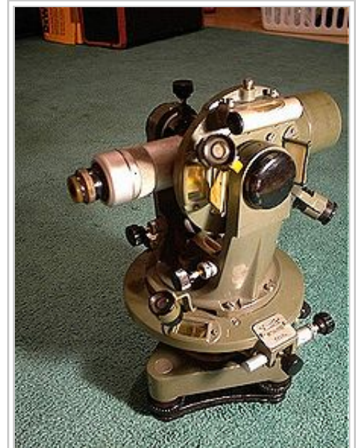
An optical theodolite, manufactured in the Soviet Union in 1958 and used for topographic surveying

The builder's level is often mistaken for a transit, but it measures neither horizontal nor vertical angles. It uses a spirit level to set a telescope level to define a line of sight along a level plane.