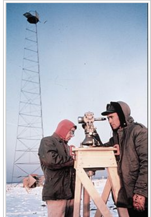
U.S. National Geodetic Survey technicians observing with a 0.2 arcsecond resolution Wild T-3 theodolite mounted on an observing stand. Photo was taken during an Arctic field party (circa 1950).

The American transit gained popularity during the 19th century with American railroad engineers pushing west. The transit replaced the railroad compass, sextant and octant and was distinguished by having a telescope shorter than the base arms, allowing the telescope to be vertically rotated past straight down. The transit had the ability to 'flip' over on its vertical circle and easily show the exact 180 degree sight to the user. This facilitated