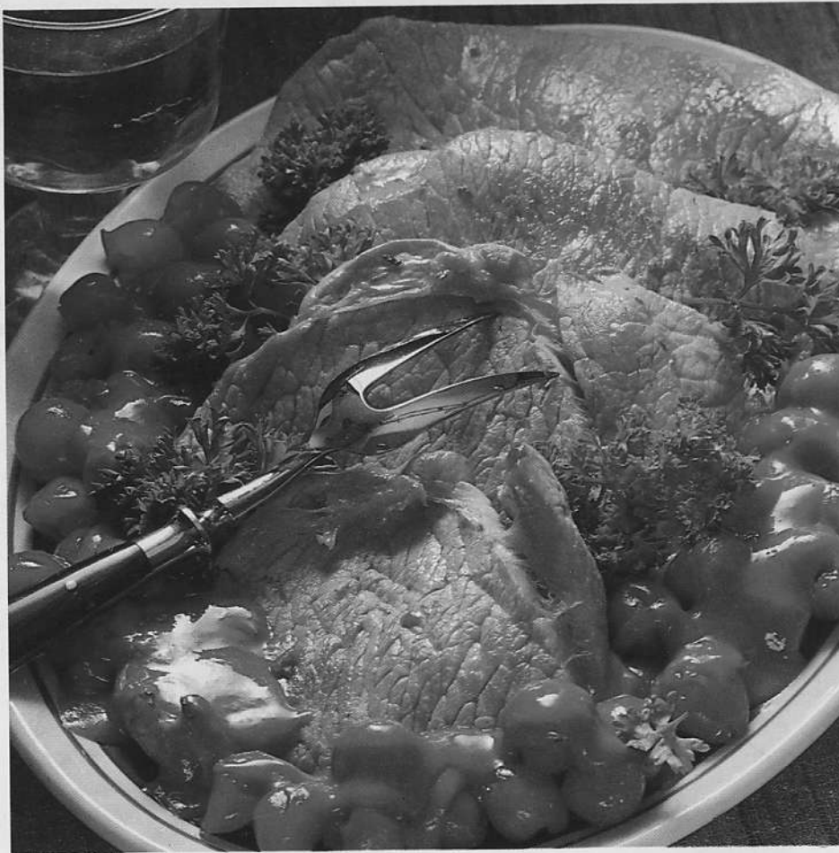
veal cutlets with cherry sauce