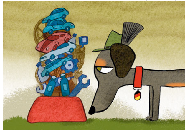
Illustration by S. Kambayashi

IT HAD been purring along nicely, handling the twists and turns of the world economy, powering past rivals, inspiring envy. But in recession Germany's export-led model is sputtering more than most. The European Commission now expects German output to shrink by 5.4% this year, compared with a 4% drop in the European Union overall; the German government predicts a 6% plunge. Most of the contraction will be in exports.