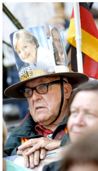
Overpampered as well as overhatted

And so, one suspects, is Ms Merkel, for whom being a woman and a one-time physicist seems to matter more than party dogma. Her star appointment was Ursula von der Leyen, a mother of seven, who as family minister introduced "parents' pay", a benefit to encourage middle-class women to bear more children without abandoning their careers. In concert with the states she started a scheme to build pre-schools for all children of parents who want them by 2013, which will help women into the workforce. Ms Merkel brought the government's "integration co-ordinator" into the chancellery and put together an "integration plan" to impart Germany's language and values to immigrants and upgrade their skills.