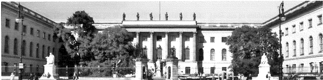
above: Humboldt Universität

I shall now give you a good overview of my findings on what the different German cities have to offer. All references are listed on my reference page with all website links. First, I will begin with one of the most interesting and highly active Universität in the fields of Kunstgeschichte und Archäologie ; Humboldt Universität, Berlin.