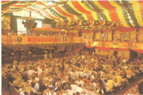
Munich Oktoberfest tent

Burg Eltz, which has been in the same family for 800 years.