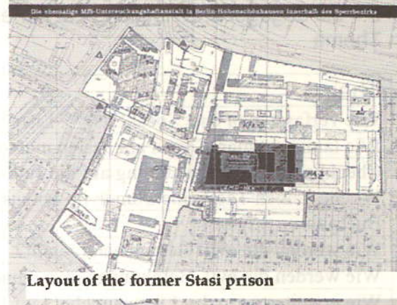
Layout of the former Stasi prison

There a couple of companies in Berlin (and in other parts of Eastern Europe) that rent Trabants, the old East German car. I'm sure they're safe! They offer a tour of the sites of East Berlin. I would also like to go the Stasi Museum, housed in the former headquarters of the East German Ministry of Security. The German government has preserved the office of the last head of security so people can see where he worked. To follow up with the Stais theme there is a former prison that has been preserved and is now the Hohenschönhausen Memorial. Many of the tours are conducted by former inmates.