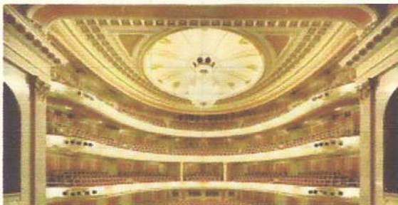
The Staatsoper in Berlin

For night time entertainment I was thinking we should check out a cabaret, like Bar Jeder Vernunft, or try to see an opera, especially if it's Wagner.