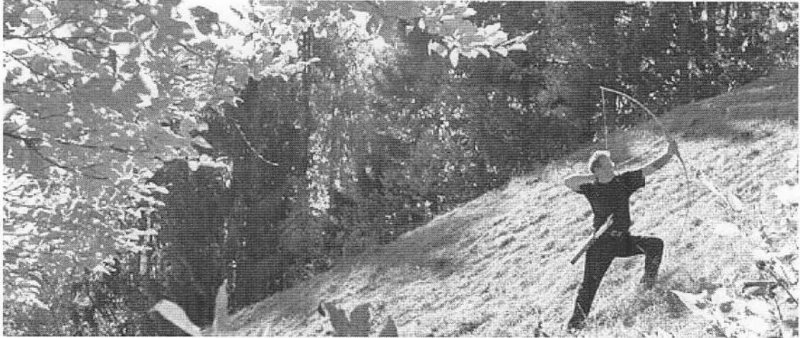
Figure 1: Archery at Abenteuerhof Inn