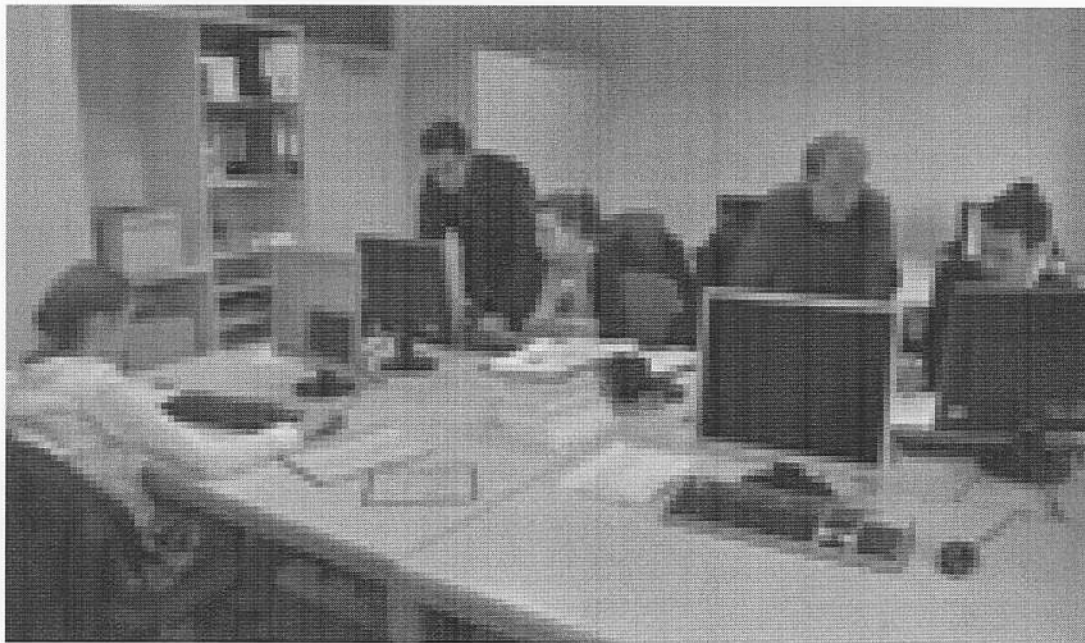
Figure 6: Research in progress at the Karlsruhe University.