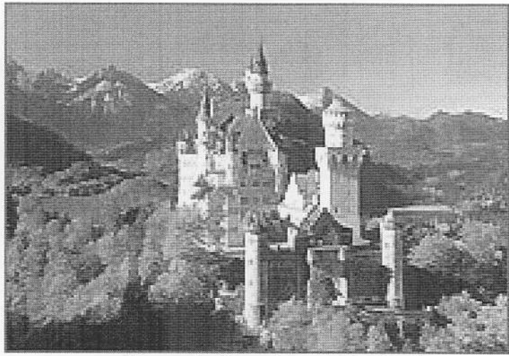
Figure 3: Neuschwanstein Castle