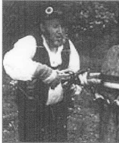
Figure 4: Traditional male clothing in the Black Forest