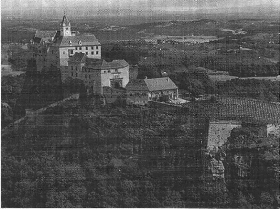
One of the many Austrian castles.