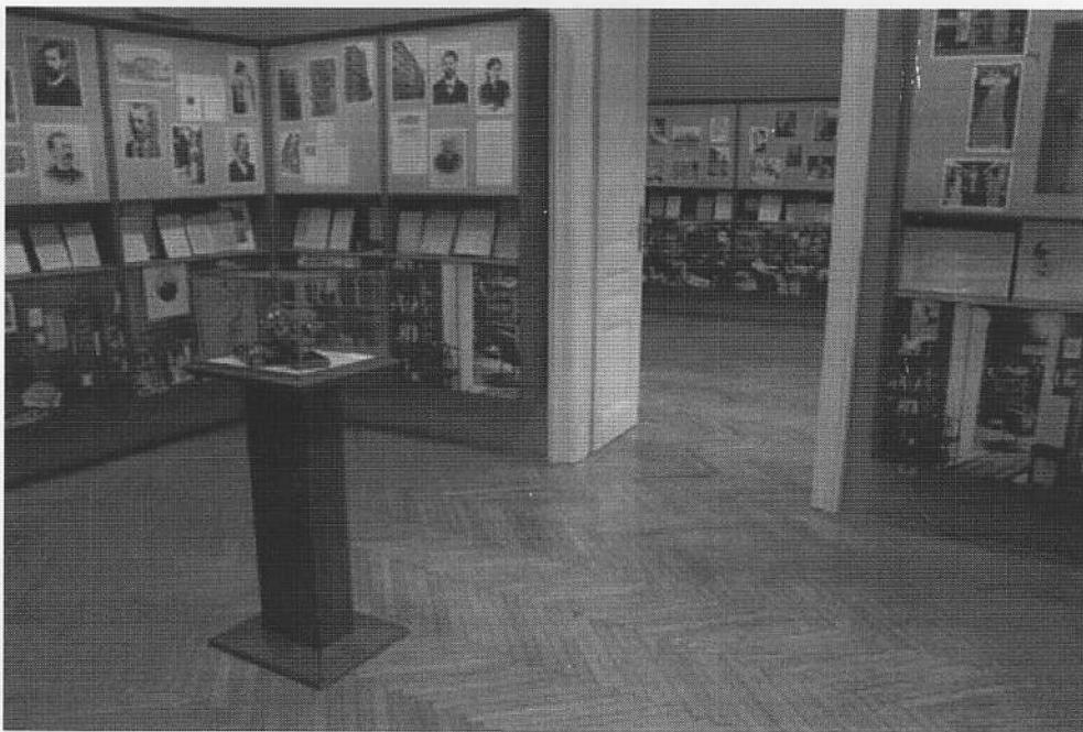
Inside the Sigmund Freud Museum