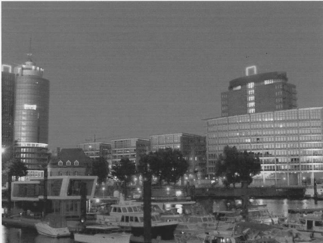
Kehrwiederspitz at night.