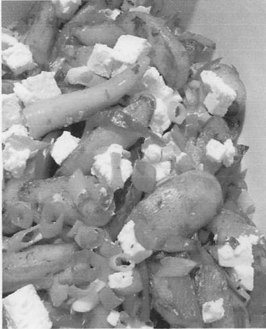
Kartoffelgyros (potato gyros)!