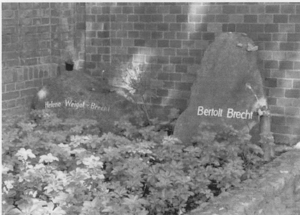
Bertolt Brecht's grave in Berlin. He's buried with his wife, Helene Weigel.