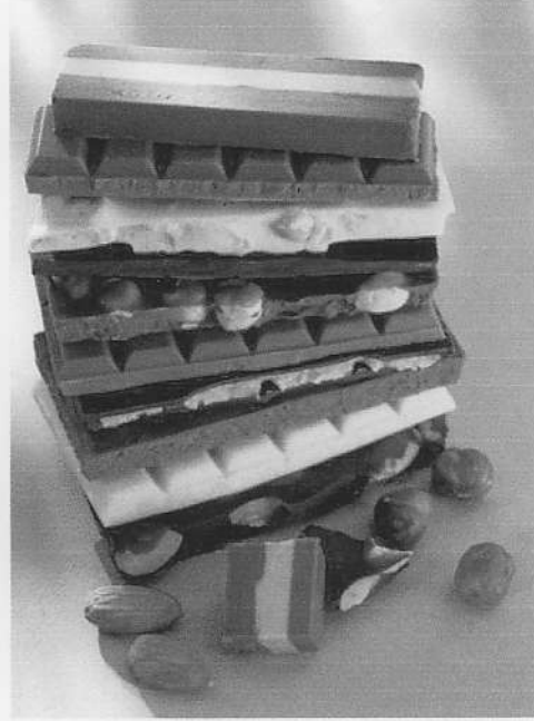
German chocolate. Mmm.