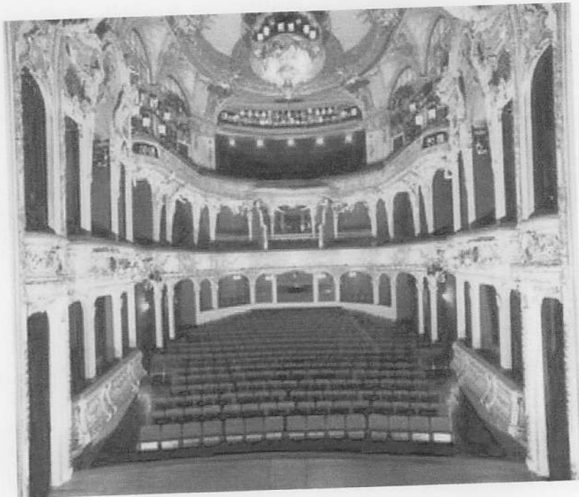
Inside of the Berliner Ensemble theatre.