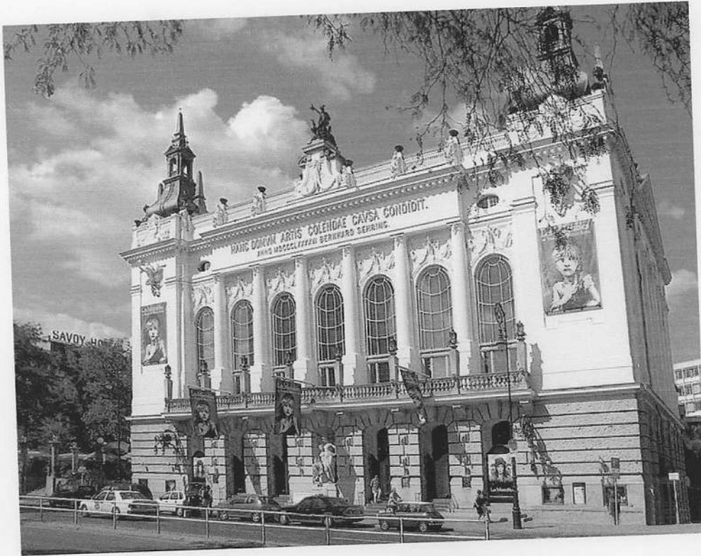
The Theater des Westens Berlin.