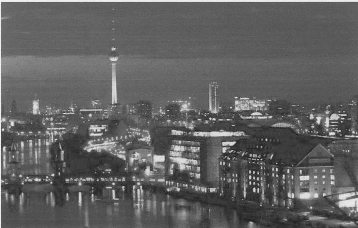
Berlin at night.