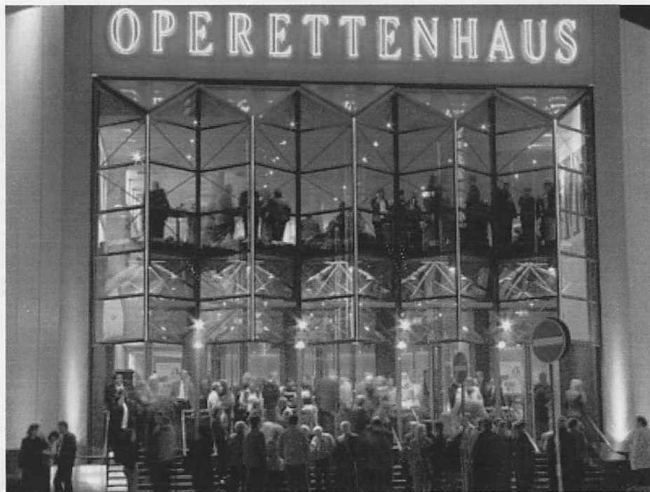
The Operettenhaus in Hamburg.