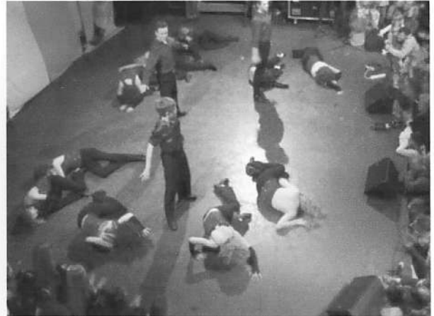
Rince Tr Na ng perform "Snake Dance" St. Patrick's Day - Munich March 2004