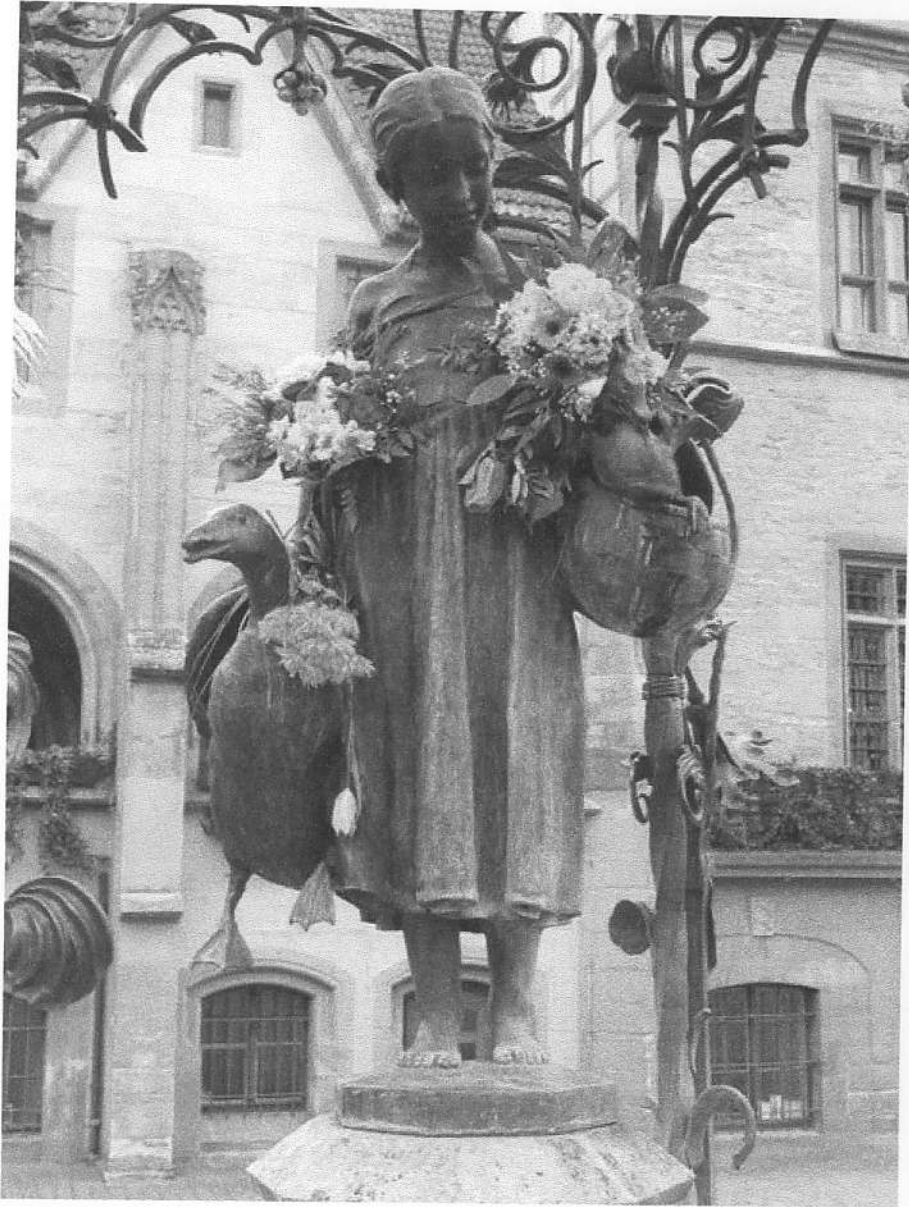
Das ist Gänseliesel (goose girl)