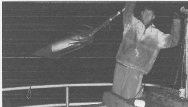
View full size

By Lori Tobias, The Oregonian April 09, 2010, 7:40PM