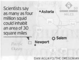
View full size