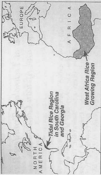
FIG. 1.—Rice cultivation along the Atlantic basin, 1760–1860. (All drawings by Chase ngford.)

The South's most lucrative plantation economy continued to inspire nostalgia well into the 20th century, when the crop and the incalculable fortunes it delivered remained no more than a vestige of the racial landscape. Numerous commentaries documented the lifeways of the planters, their achievements, as well as their ingenuity in shaping a profitable landscape from malarial swamps. 6 These accounts over-presented African slaves as having contributed anything but their unskilled labor. The 1970s witnessed a critical shift in perspective, as historians Converse Clowse and Peter Wood drew attention to the skills of slaves in the evolution of the South Carolina economy. Clowse, writing in 1971, revealed the importance of skilled African labor in ranching and forest extractive activities during the early colonial period. Wood's careful examination of the role of slaves in the Carolina rice plantation system during the same period, published in 1974, challenged the prevailing planter-biased rendition of the rice story. His scholarship recast the prevalent view of slaves as mere field hands and showed that they contributed agronomic expertise as well as skilled labor to the emergent plantation economy. Wood's evidence