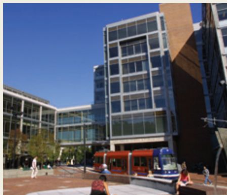
The Urban Center at Portland State University

Portland State University, Oregon's only urban university, is the largest and most diverse in the state system. The University's position in Oregon's economic and cultural center allows for deep community engagement and the creation of partnerships with hundreds of organizations throughout the region—partnerships that give PSU students valuable learning opportunities as they solve real-world problems of business and community. Portland State offers more than 100 undergraduate, master's, and doctoral degrees, as well as graduate