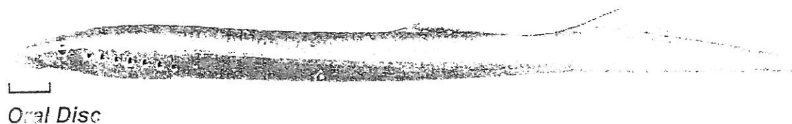
Fig. 1. Photograph of a Pacific Lamprey ( Lampetra tridentata ).

1998 editor) reveals that lamprey are listed as food items for 13 out of 43 named Native American tribal groups (Table 1). Detailed descriptions of the cultural importance and traditional ecological knowledge of lampreys have been collected and published for American Indian groups such as the Umatilla (Close et al. 2002; Close et al. 2004). At least two types of lamprey are recognized and distinguished by native peoples on the Plateau (Close et al. 2004). Among Sahaptin speaking peoples along the Yakima River, two different names are used to refer to lampreys from the stretches of the river above and below Rock Creek (Hunn et al. 1990).