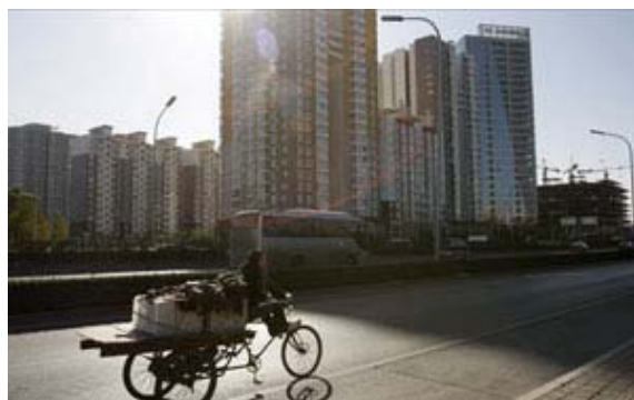
Thought liberation is a long way away