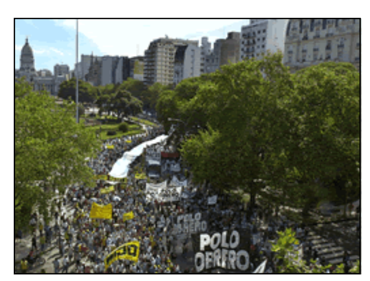
Thousands of demonstrators march near Buenos Aires' Congress March 15, 2002 hoping to call attention to rising poverty and joblessness after a January devaluation.