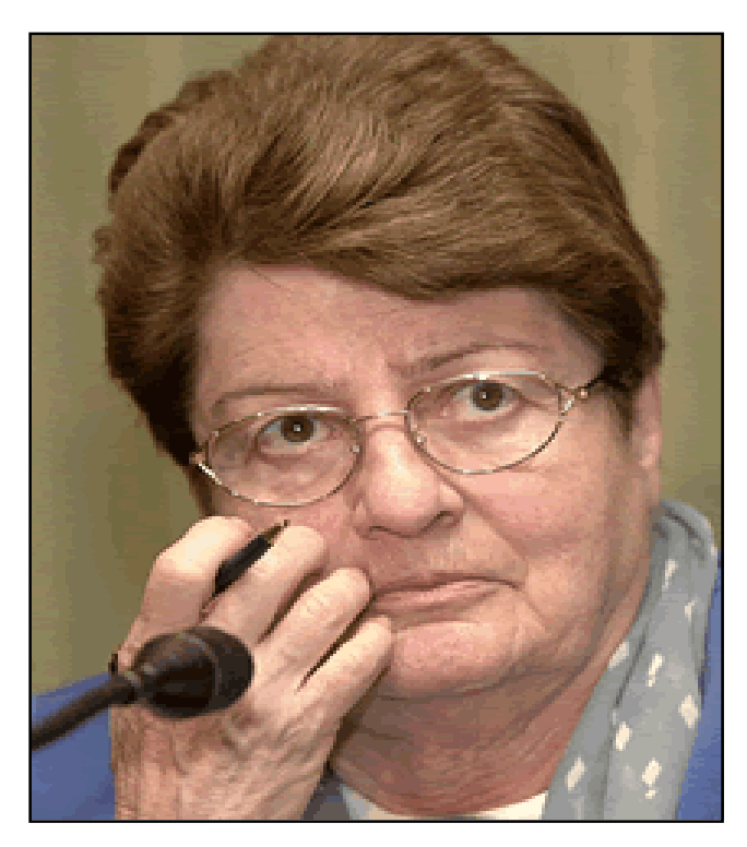
Anne Krueger, Deputy Manager Director of the IMF, addresses a news conference in Santiago, Chile, Jan. 2002, saying Argentina must present a sustainable and coherent economic plan in order to get assistance.

provide a false sense of security; market participants may attach too much value to these indicators, ignoring other relevant information. It may induce emerging markets to 'distort' the indicators in order to signal their relative soundness. As the previous discussion illustrated, short of deeper reforms, these signals may be misleading, and may not indicate a genuine reduction in vulnerability.