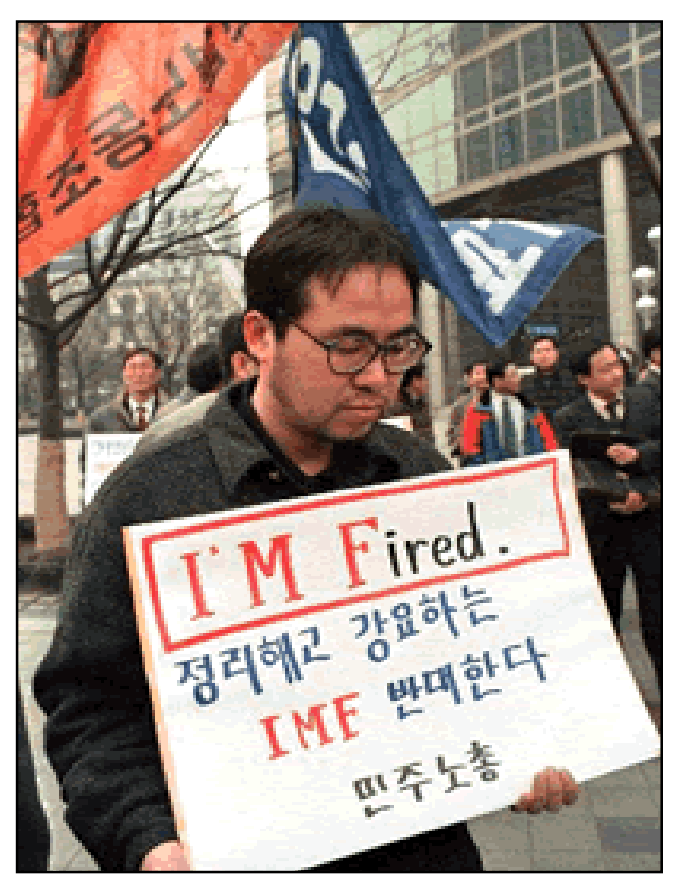
South Korean workers protest against the International Monetary Fund (IMF) in Seoul, Dec. 17, 1997. The currency had lost more than half of its value that year. About half the loss had come since the IMF extended a record $57 billion bailout on Dec. 3.

Jeanne (2001) illustrates the importance of understanding the forces leading to vulnerability as a necessary condition for evaluating the welfare effects of changing the international financial architecture. Specifically, he focused on understanding the maturity structure (the relative weight of short- and long-term debt) of countries' external liabilities as the solution to an incentives problem. He considered a country attempting to borrow when there is uncertainty about its solvency due to shocks beyond the control of the government. The country can enhance its solvency by implementing a costly fiscal adjustment, and it can borrow on a short term or a long-term basis. This situation imposes a trade off -when government's solvency deteriorates; short-term debt becomes less expensive or more accessible than long-term debt. This comes with a cost: the government is under more pressure to restore the fiscal situ-