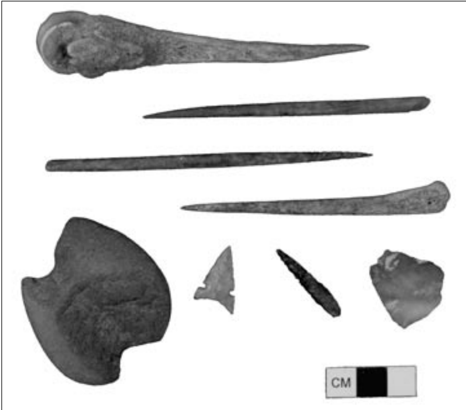
These bone and stone tools from Wakemap Mound were recovered during excavation by University of Washington crews and are curated at the Burke Museum of Natural History and Culture in Seattle, which does not have any artifacts from The Dalles like the stone and bone sculpture shown in the Portland Art Museum exhibit, “People of the River.”

important to know how we have come to acquire the tangible records of the past and what was hurt and lost in the scramble to obtain those wonders.