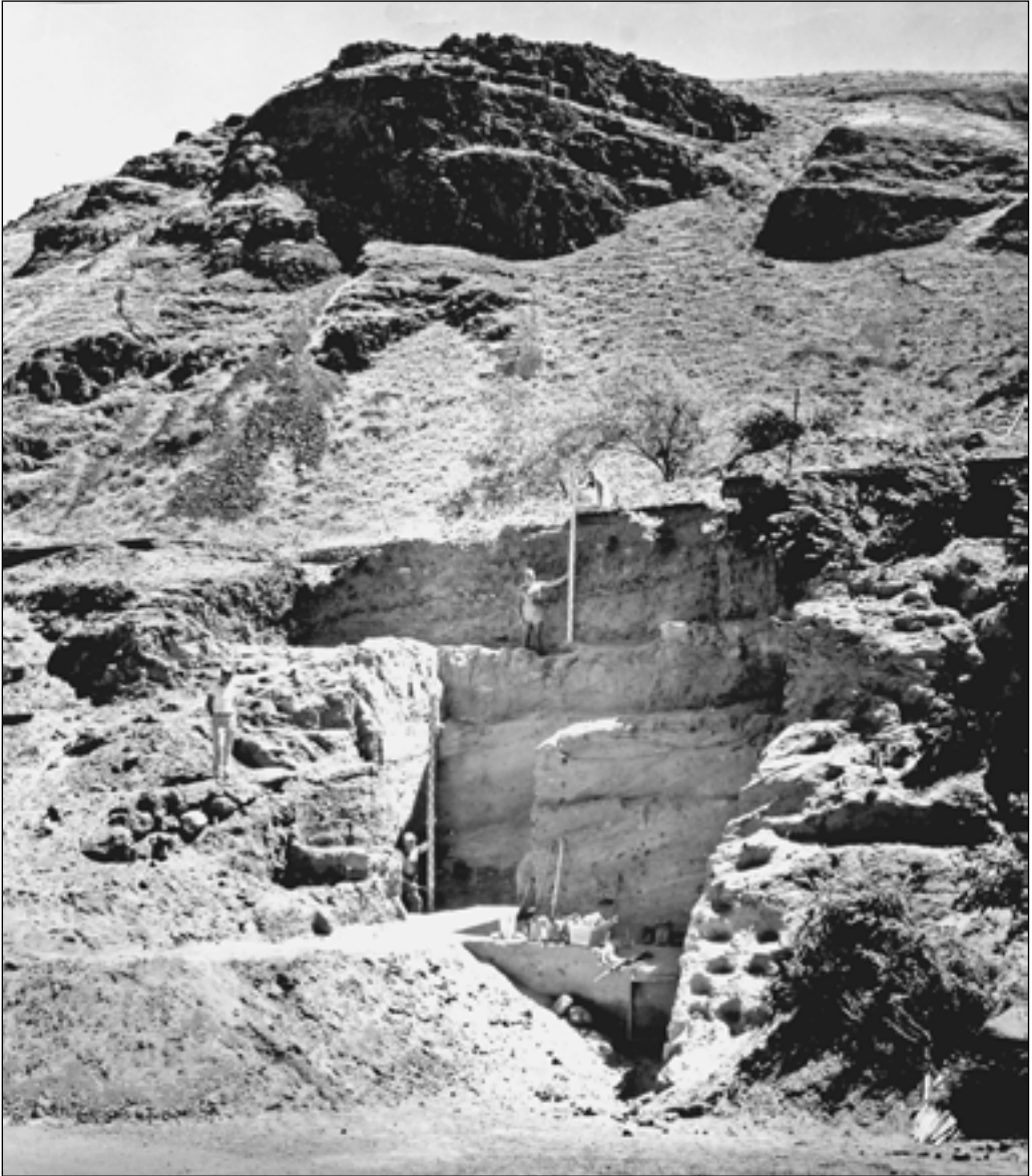
Workers pose at the Fivemile Rapids “Roadcut” site (35 WS 8) at the end of the University of Oregon excavation season in 1955. Careful study of artifacts in context demonstrates human occupation between 9300 and 5600 years ago. The deepest layers contained huge quantities of salmon bone, indicating Native people have been salmon fishing in the area for thousands of years. While not heavily looted before dam construction like Wakemap Mound, the site has been seriously disturbed. The top two meters of the about 7.8-meter-thick deposit were destroyed during construction of Highway 30; the lowest two meters were inundated when water backed up behind The Dalles Dam.