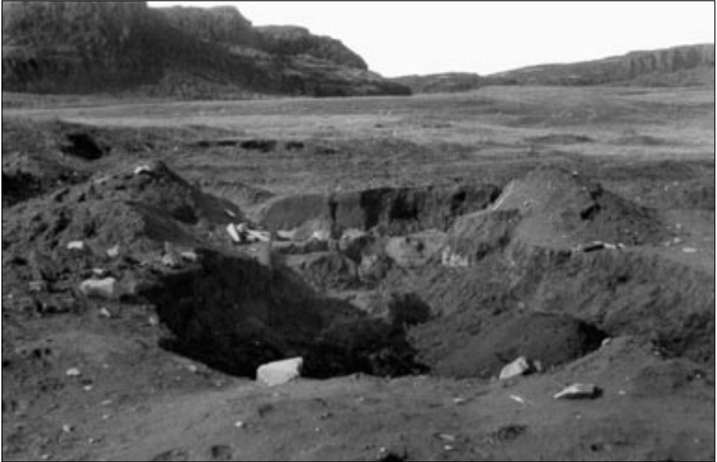
Craters were left by relic hunters at Wakemap Mound (45 KL 26), Spedis Valley, in March 1957. Anecdotal descriptions of relic hunting activity in the months before waters backed up behind the dam conjure images of a feeding frenzy. The location of most of the artifacts taken by relic hunters is unknown.

recording context of artifacts, then returning them to the agency, while also digging and claiming as many interesting items in one day as possible. Apparently, professionals from the University of Oregon, the Smithsonian, and the National Park Service accommodated this seeming contradiction. They worked with OAS members on numerous occasions, submitted articles including notes of praise to the newsletter, and spoke at monthly meetings without any outward sign of conflict or strain. 24