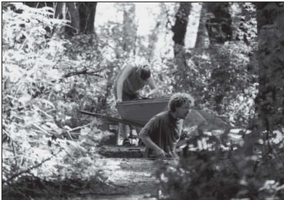
APPENDIX 2, PLATE 3: AT WORK AMONG THE COTTONWOODS OF SITE RIDGE.