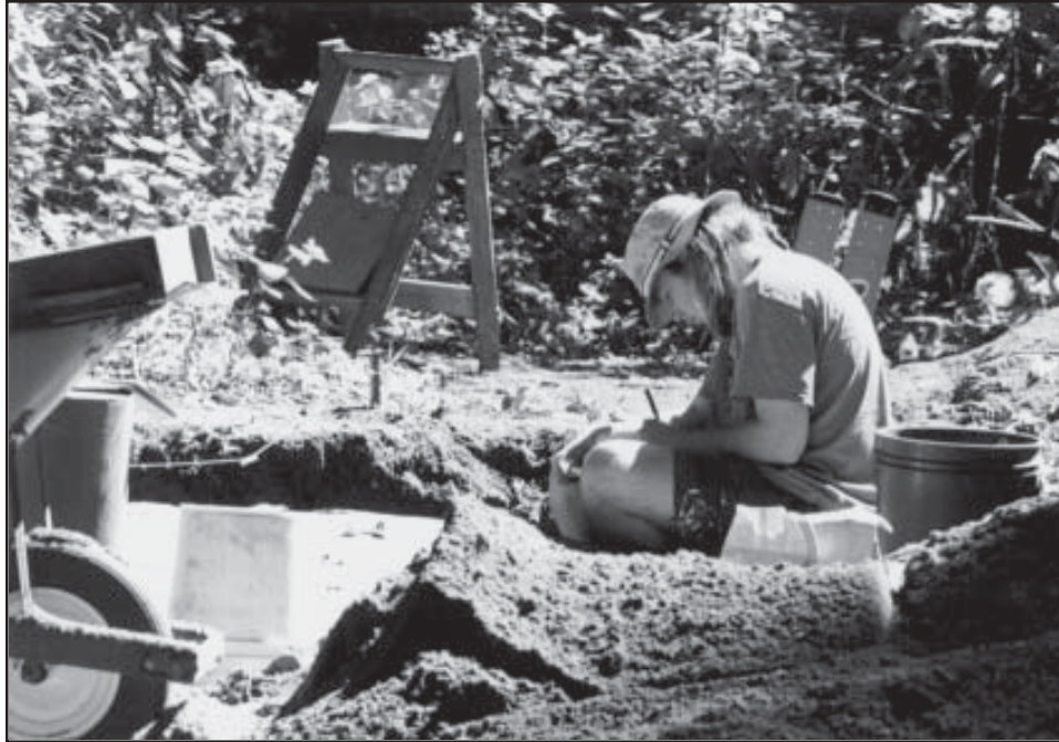
APPENDIX 2, PLATE 2: ASIDE FROM THE MOSQUITOS, THE DAPPLED SUNLIGHT AND HEAVY FOLIAGE PROVIDE A PLEASANT WORKING ENVIRONMENT.