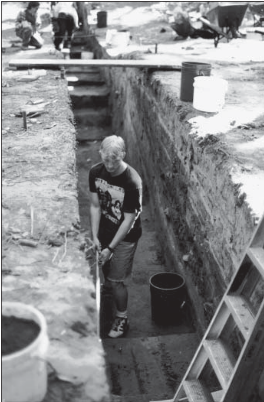
APPENDIX 2, PLATE 1: 1994 TRENCH DURING EXCAVATION.